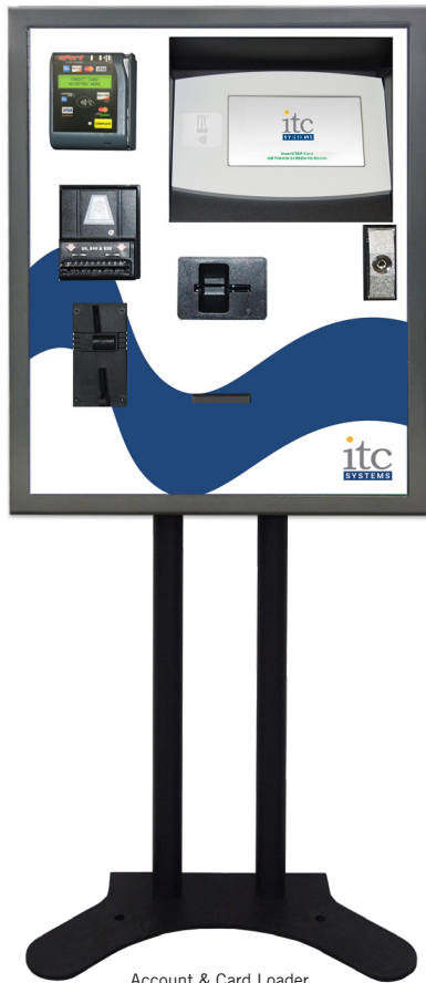
Account & Card Loader Model 7880

ITC Systems' Loaders are a key component to your cashless revenue systems. Dispense cards and add value to your accounts or card with this powerful 24-hr cashier.