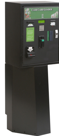
Loader Model 1580 (shown here with base)

ITC Systems also offer cash card loaders that complement the stored value readers. These card loaders can be configured to accept any combination of coin, bill, or credit cards for deposit. These loaders also have the option for a card dispenser as well as a receipt printer.