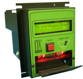
netZcom Online Vending Terminal